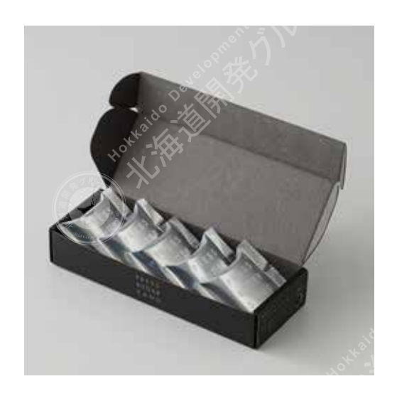
Caramel Cream Sandwich Cookies Rum chocolate 5 pieces Kanto limited