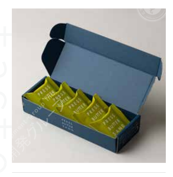
Caramel Cream Sandwich Cookies Uji Matcha 5 pieces Kansai limited