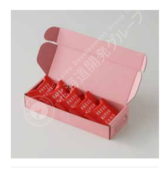
Caramel Cream Sandwich Cookies Fukuoka strawberries 5 pieces Kyushu limited