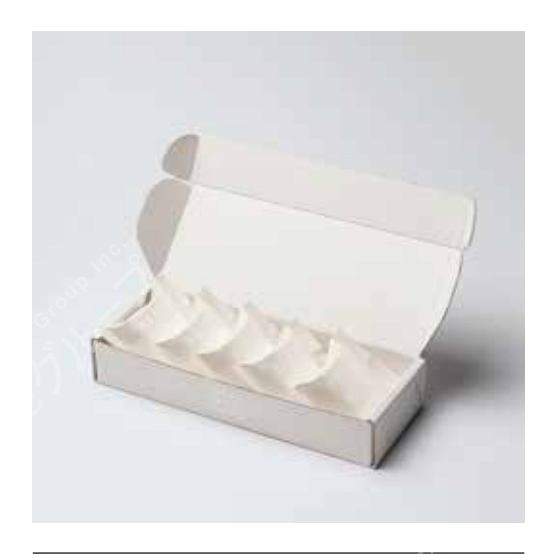
Caramel Cream Sandwich Cookies Vanilla white chocolate 5 pieces Hokkaido limited