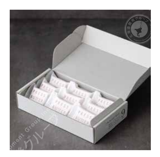
Caramel Cream Sandwich Cookies Original flavor 9 pieces