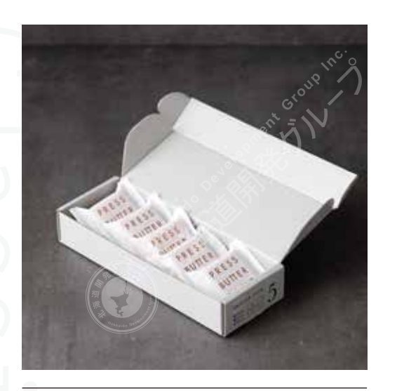
Caramel Cream Sandwich Cookies Original flavor 5 pieces