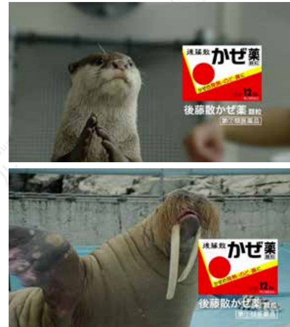
umitamago(Oita Aquarium) Crossover CM