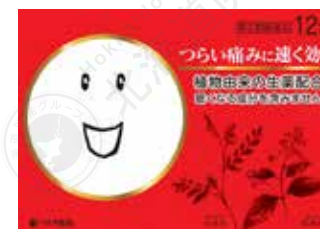
GOTOSAN Pain Relief Granules G CM